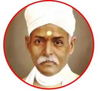
Madan Mohan Malaviya